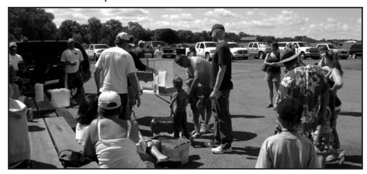
A busy weigh-in at the 2009 Adult Child Outing