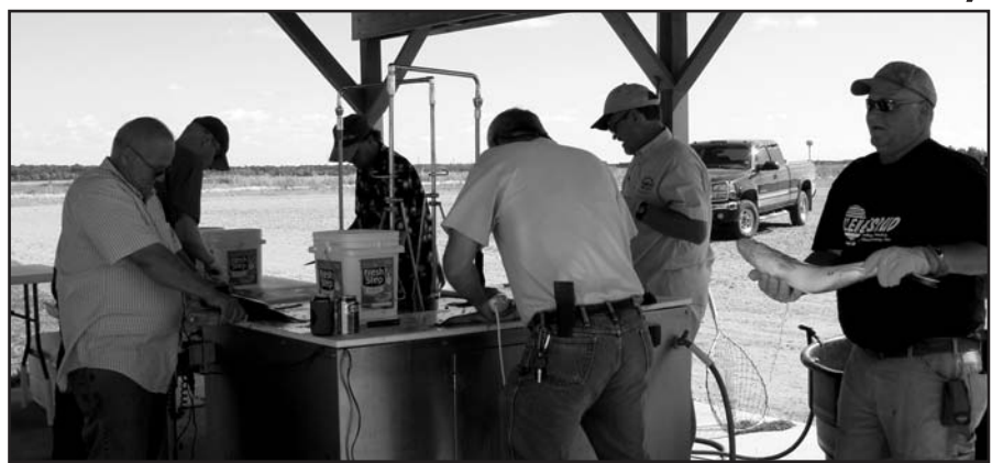
LRAA Volunteers clean fish for the Cabela's National Team Championship

Lake Region Anglers cleaned fish for the MWC/NTC tournament in July. Over 1300 big walleyes. It was quite a project and thanks to the many volunteers it went very well. We used the fish to feed over 700 people at the Fish Fry and Corn Feed in August. Below are listed the volunteers that helped with one or both of the events. If you see them tell them thank you.