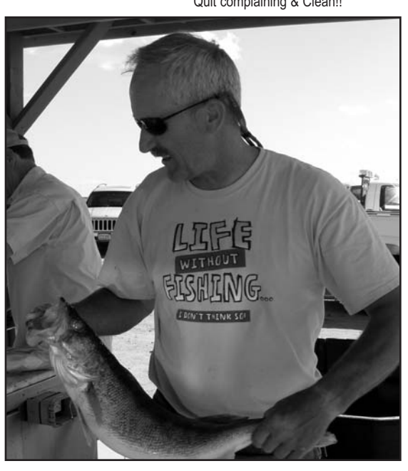
Quit complaining & Clean!!