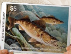
Al Lindner Legendary walleye angler

You do not need a walleye stamp to catch and keep walleye. Your $5 voluntary donation flows directly to a dedicated DNR account for walleye stocking. For $2 more, the DNR will mail the actual collector's stamp to your door.