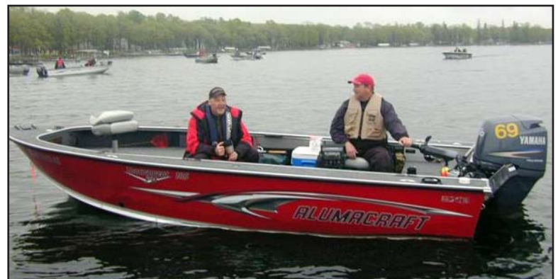
Waiting for the start of the Pelican Classic