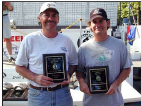
6th Place: Fitch/Fitch