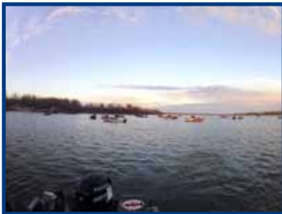
Waiting for take off at Pine Falls Mid-Canada PWT Greenback Championship