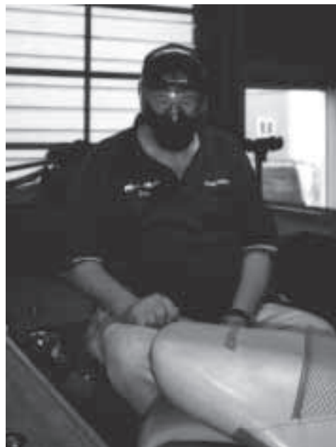
Who Is That Masked Man?