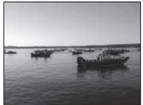
Waiting for the start...

Thank you once again to all of our sponsors, competitors, volunteers and FairHills Resort for making this another successful tournament!