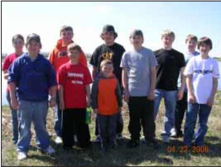
Waubay Outing Youth Participants