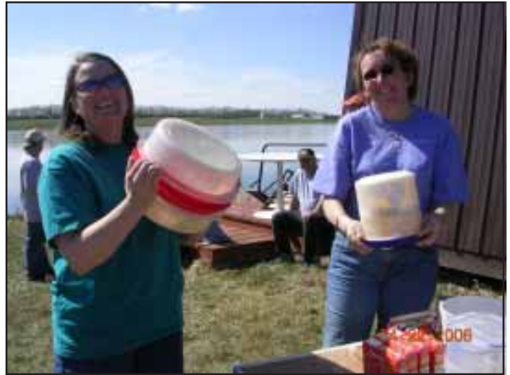
Breaders at the Waubay Outing Walleye Feed