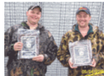
2nd: Woodard & Bergquist 11 Fish, 21.33 lbs.