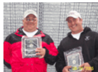
6th: Kinslow & Kinslow 7 Fish, 16.40 lbs.