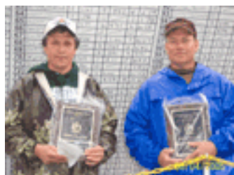
5th: Samson & Ramlo 12 Fish, 16.70 lbs.