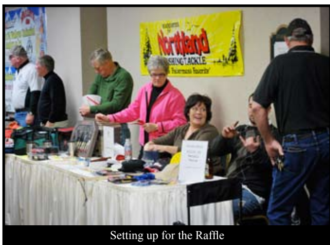
Setting up for the Raffle