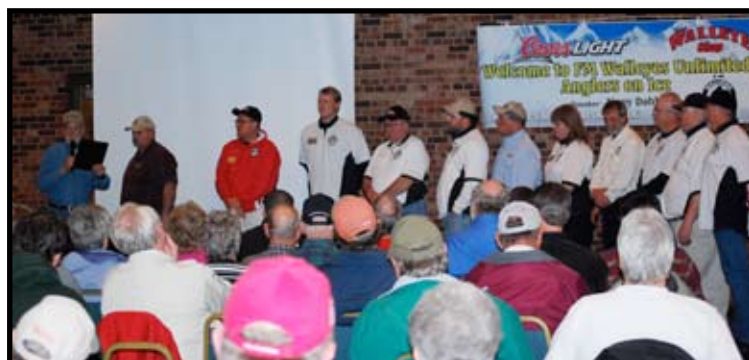
The Board Receiving the Award