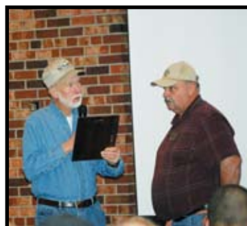
Presenting the Award