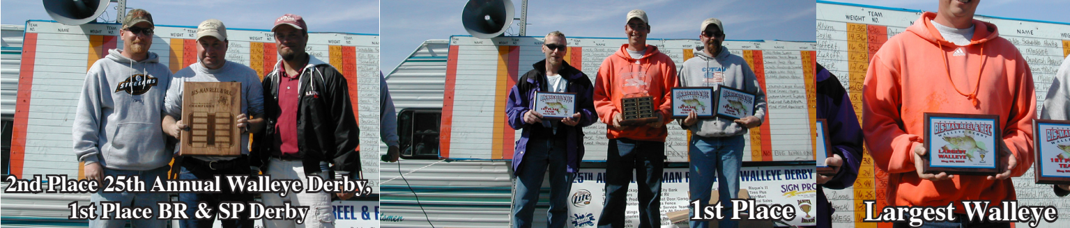
2nd Place 25th Annual Walleye Derby, 1st Place BR & SP Derby