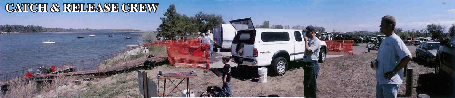
CATCH & RELEASE CREW