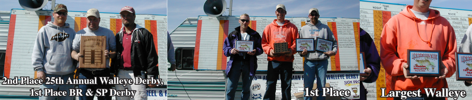
2nd Place 25th Annual Walleye Derby, 1st Place BR & SP Derby